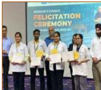
Most Aspiring Project award at SCHOLARS COUNCIL PROJECTS Competition