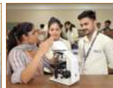
Shareera Kriya Lab