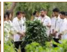
Drug Identification Well Developed Herbal Garden