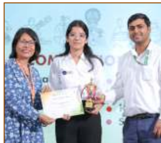
Ek Bharat Shrestha Bharat'24 at SGT University 3rd position in backdrop making competition