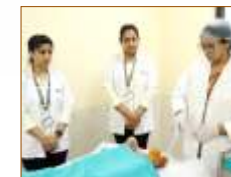
Agnikarma Procedure Well Equipped OT

6. CAREER SERVICE AND INDUSTRY PARTNERSHIPS: Faculty provides 100% placement assistance to eligible candidates through industry mentors in the form of mock interviews, industrial Vitus, workshops, industrial internships, boot camps and networking events with potential employers Aligning students with industry requirements for placements and providing them with career services is supervised by CRC.