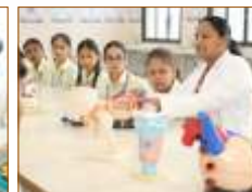
Shareera Rachana Lab