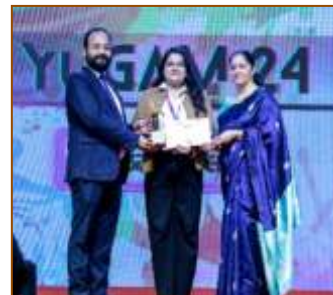
Special Mention Award at YUGAM 2024