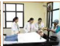
Shirodhara procedure Well- equipped Panchkarma Hospital